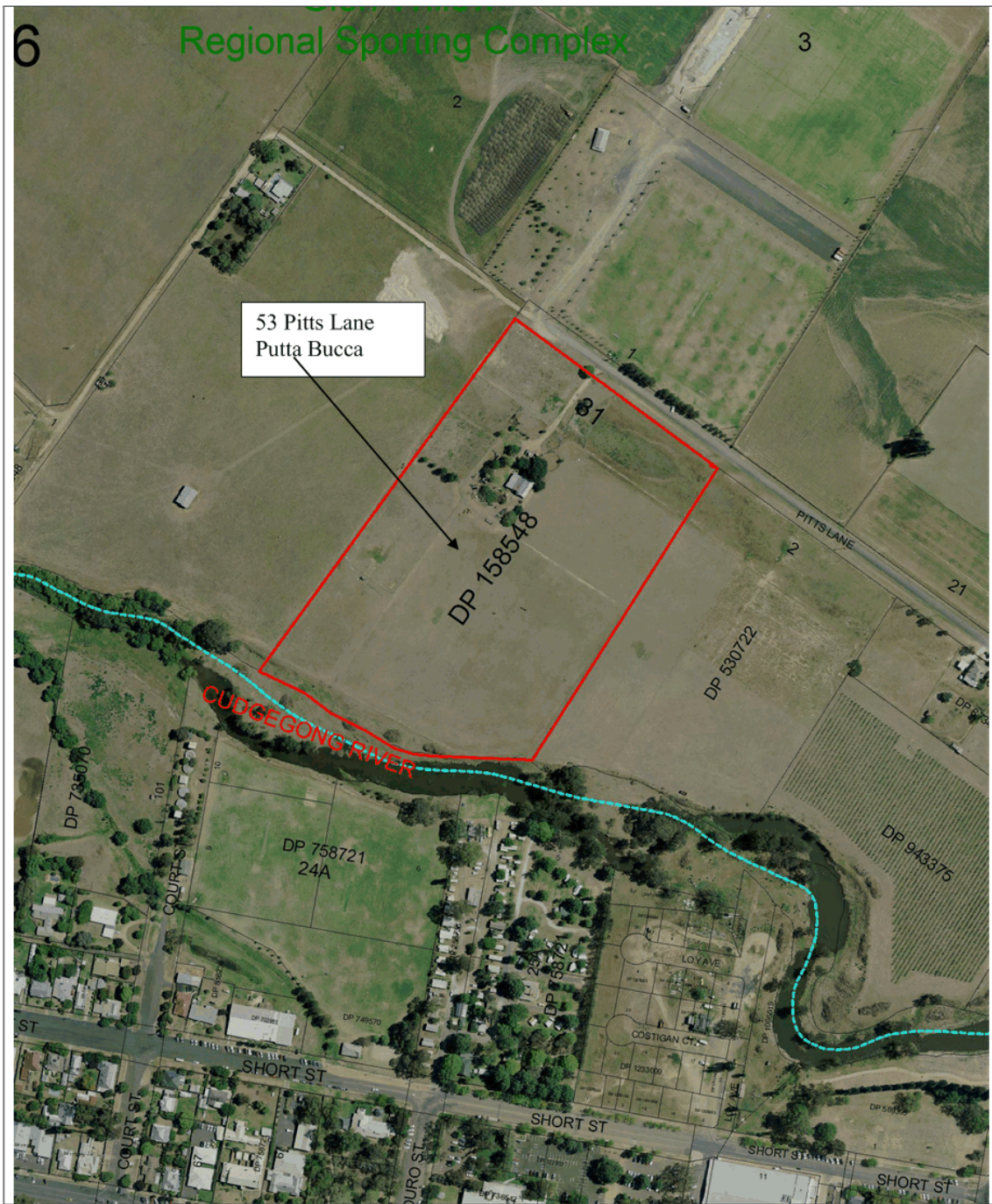
Map Scale: 1:4,275