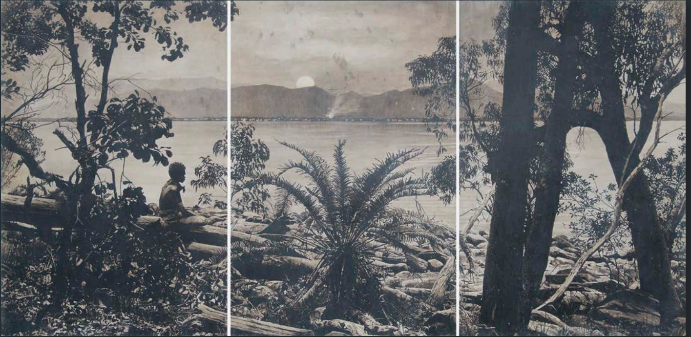
Danie Mellor, On the edge of the darkness (the sun also sets) , 2020 © the artist