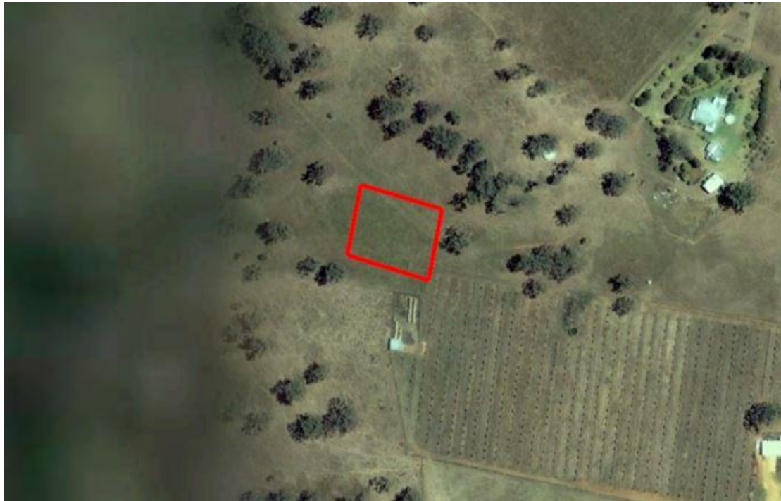
Plate 2 – Aerial Image 2003.

A review of Google Earth imagery of the site indicates that the site is in similar condition as to when an image was taken in 2003. The site is therefore assumed to be natural ground with no recent tree removal or fill placed. Images exist back to 1985, yet the image is not clear enough to determine what was on the site. See 2003 aerial image below: