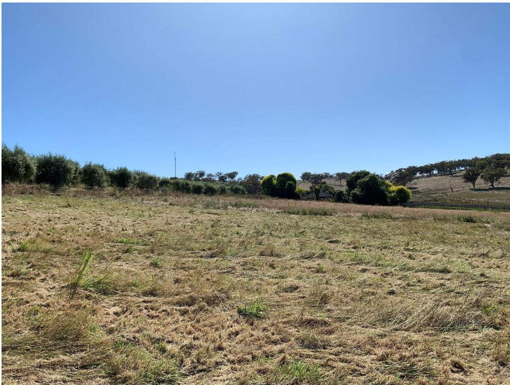
Plate 1 – South facing view

Any trees noted to be within the building zone, should be removed and the excavation remaining should be backfilled with natural material and reinstated in layers to a minimum of 95% Standard Maximum Dry Density