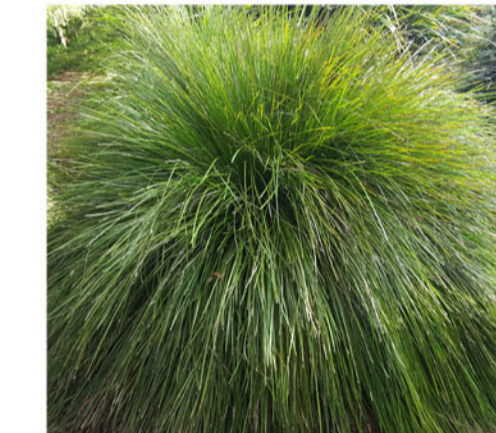
LOMANDRA LONGIFOLIA 'TANIKA' MATT RUSH