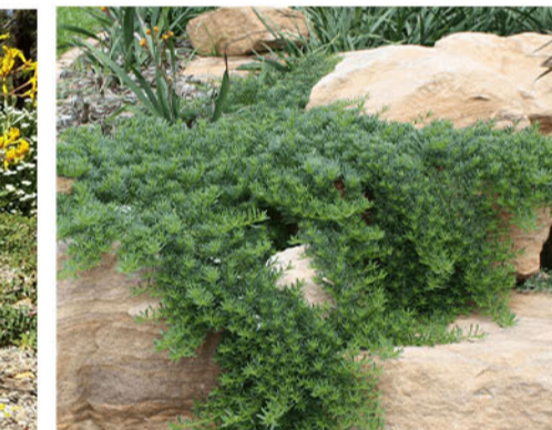
MYOPORUM PARVIFOLIUM CREEPING BOOBIALLA