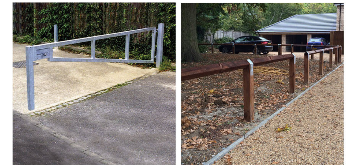
[GAT] 3700MM WIDE SWING BARRIER GATE [FEN] 600/400MM HIGH POST & RAIL FENCING