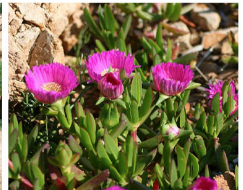
CARPROBOTUS GLAUCENS PIG FACE