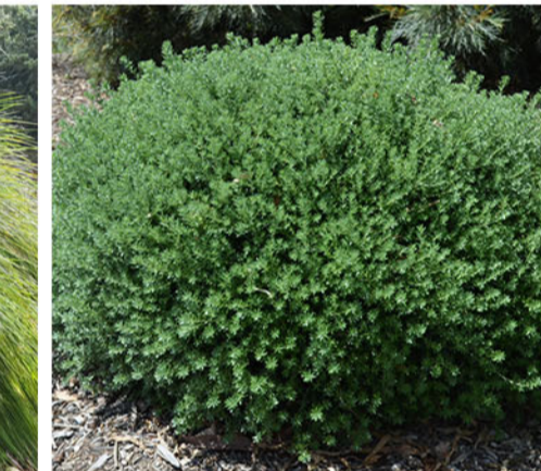
WESTRINGIA FRUTICOSA ZENA COASTAL ROSEMARY