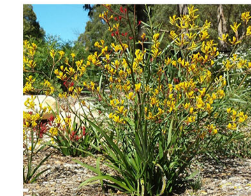
ANIGOZANTHOS 'YELLOW GEM' KANGAROO PAW