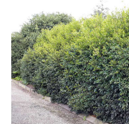
ACMENA SMITHII 'SUBLIME' SUBLIME LILLY PILLY