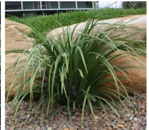
LIRIOPE MUSCARI 'JUST RIGHT' LILY TURF